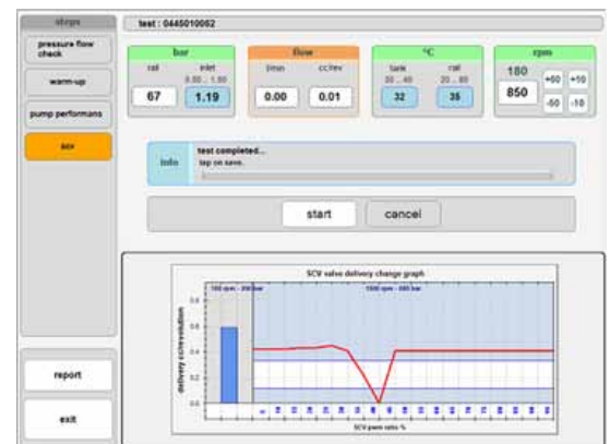
SCV Valve Test Screen