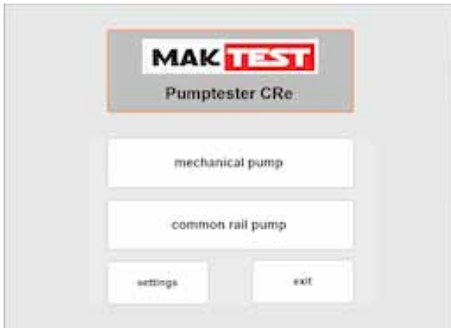
Home Screen of PT2012.CRe Test Control Software