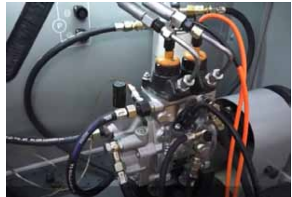
Easy Mounting of any CR Pump