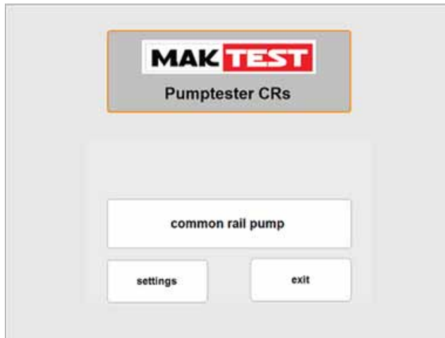
Home Screen of TK1035 Test Control Software